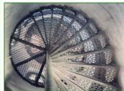
Left photo: Middle Island Light; Top Right photo: Bollards at the Old Presque Isle Lighthouse; Bottom Right photo: New Presque Isle Light staircase.