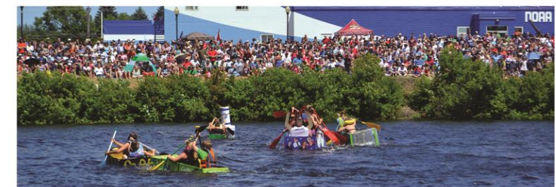
Above: The Cardboard Boat Regatta; family fun can't get more unique than this!